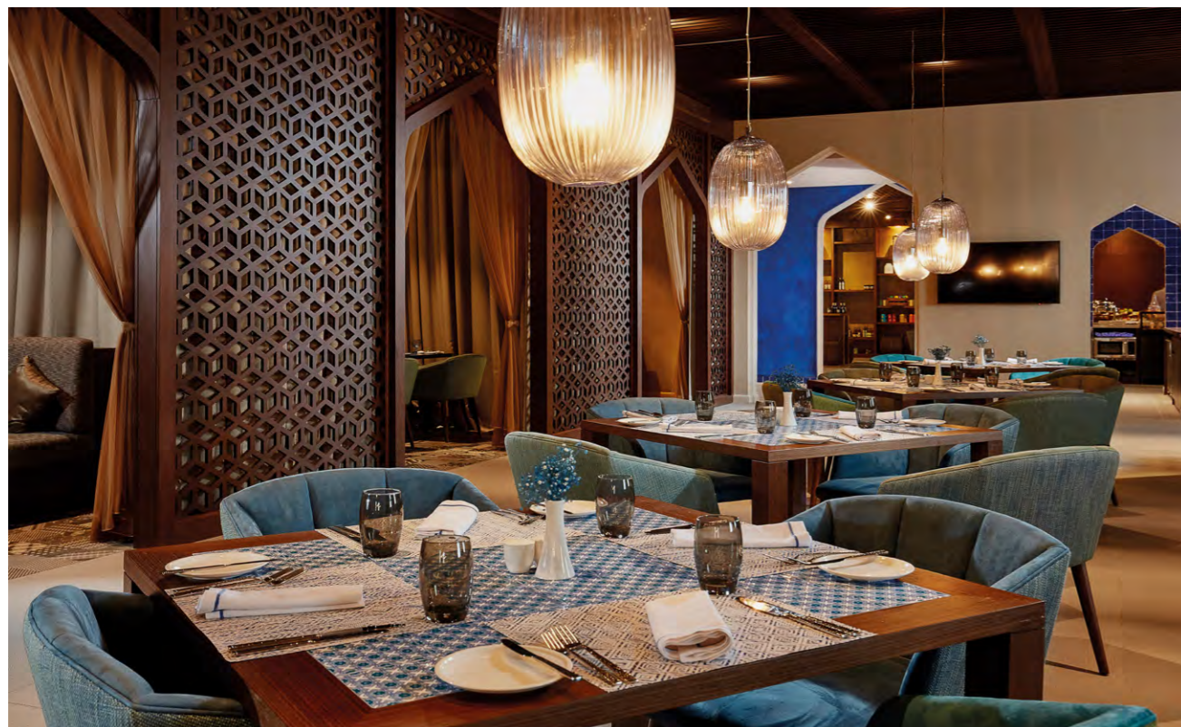
All Day Dining