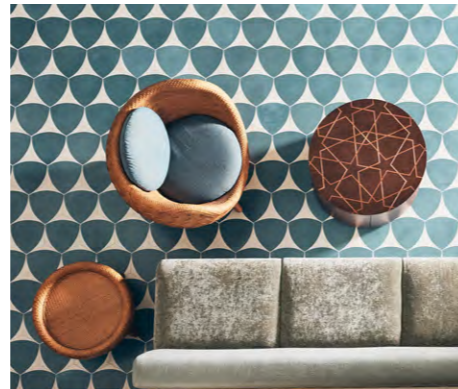
Lobby flooring & furniture details