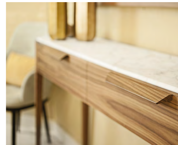
Lighting & furniture details