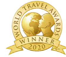
World Travel Awards 2020: Winner Saudi Arabia's Leading Luxury Hotel

Peace and calmness are the main inspirations to develop the interiors of the spaces, both felt within the atmosphere while welcoming its guests. A color narrative of cream and aqua palettes is followed throughout the inner spaces, two calming and muted hues which provide the necessary frame of mind to favor contemplation and serenity.