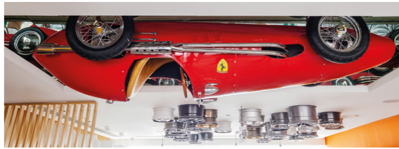
All day dining

Vintage cars suspended from the ceilings, corridors that resemble a circuit with pedestrian crossings located in front of the lifts, or different car parts like alloy wheels and tires painted in different colors which hang from the walls of the lobby and restaurants give a sense of adventure and fun, all in a contemporary and relaxed setting, with a strong sense of place. This twist complements the international style employed in the choice of materials and palettes in order to make the racing objets stand out and at the same time naturally integrating them into the decoration.